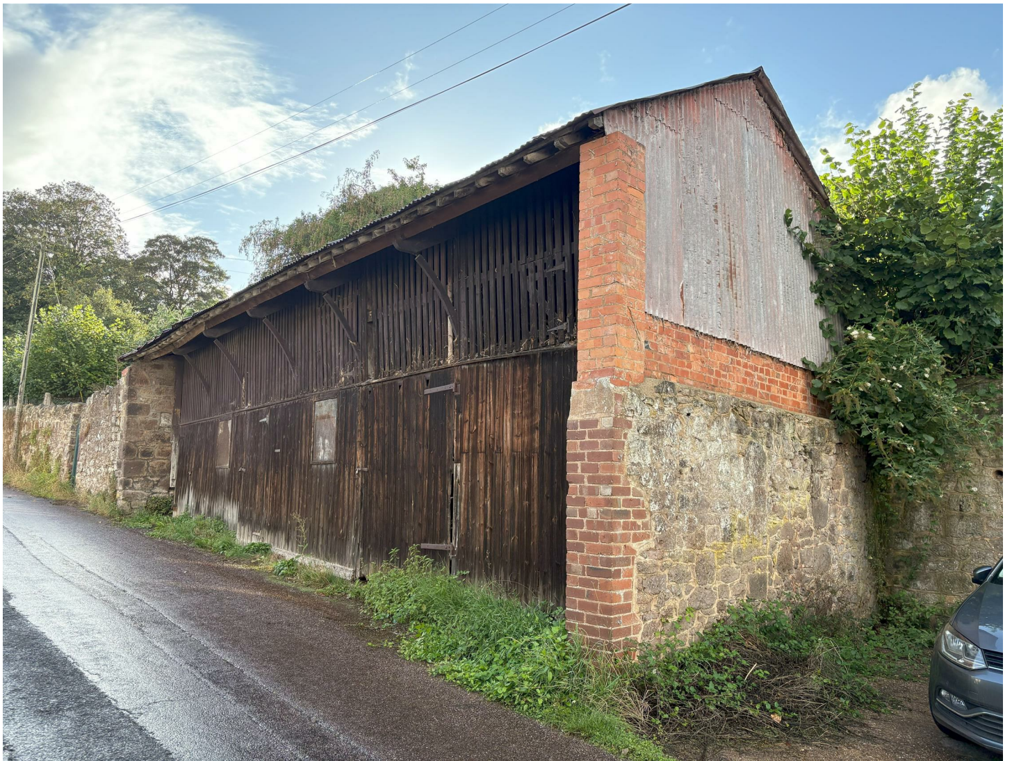
Barn and Land at Hele